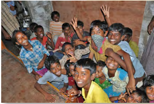
Muslim and fortune tellers' children.