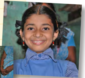
Tribal gypsy children.