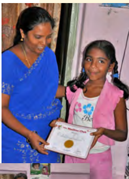
Leaders from the host home giving out certificates.