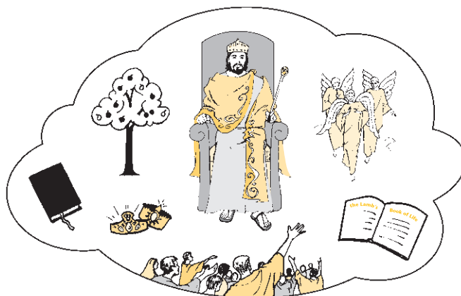
These WILL BE in Heaven

Now I have some wonderful news for you: God wants YOU to be in Heaven with Him! This is true. God knows your name and He wants you to be in Heaven with Him some day.