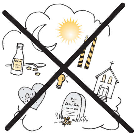
These WILL NOT be in Heaven

The most wonderful thing about Heaven is this: the Lord Jesus will be there! He is our Savior—the One who died on the cross for our sins, so we could be forgiven of our sins and go to Heaven.